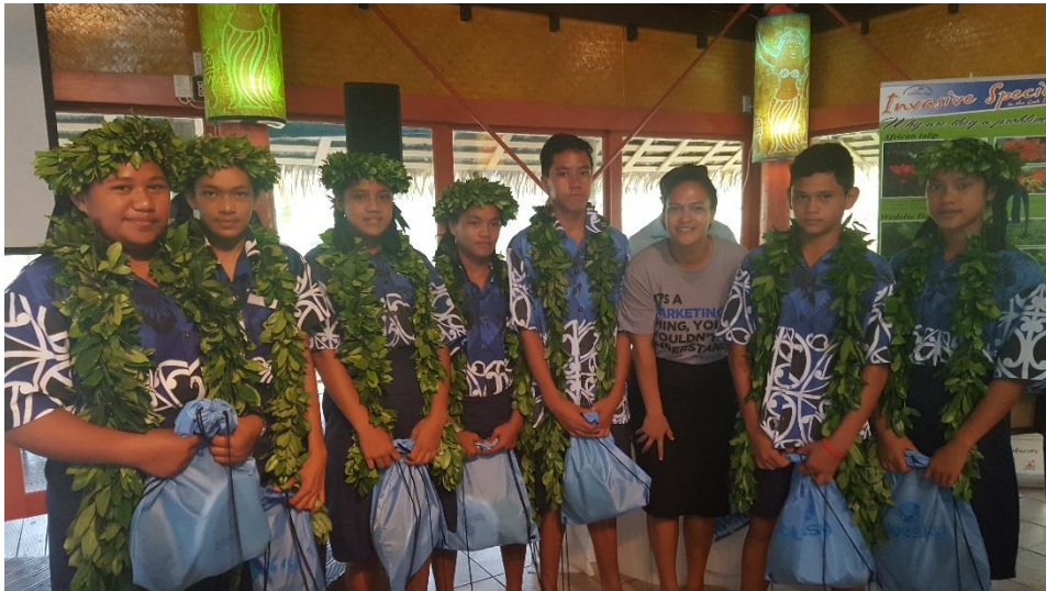
Outer Island Students