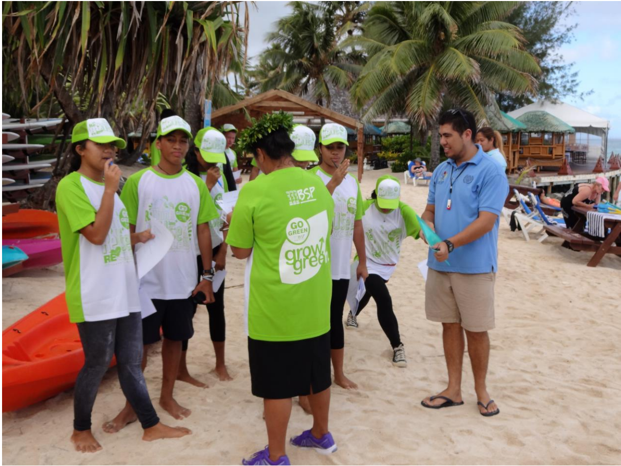
SBMA Staff assisting with GPS activity