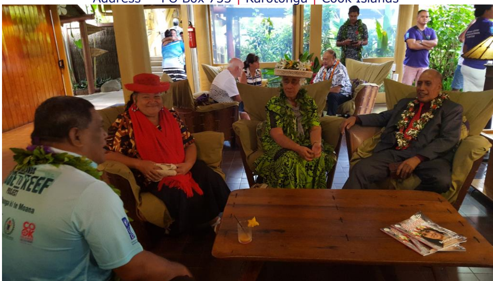
Traditional Leaders at opening