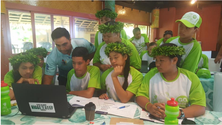
NES Staff assisting with GIS activity